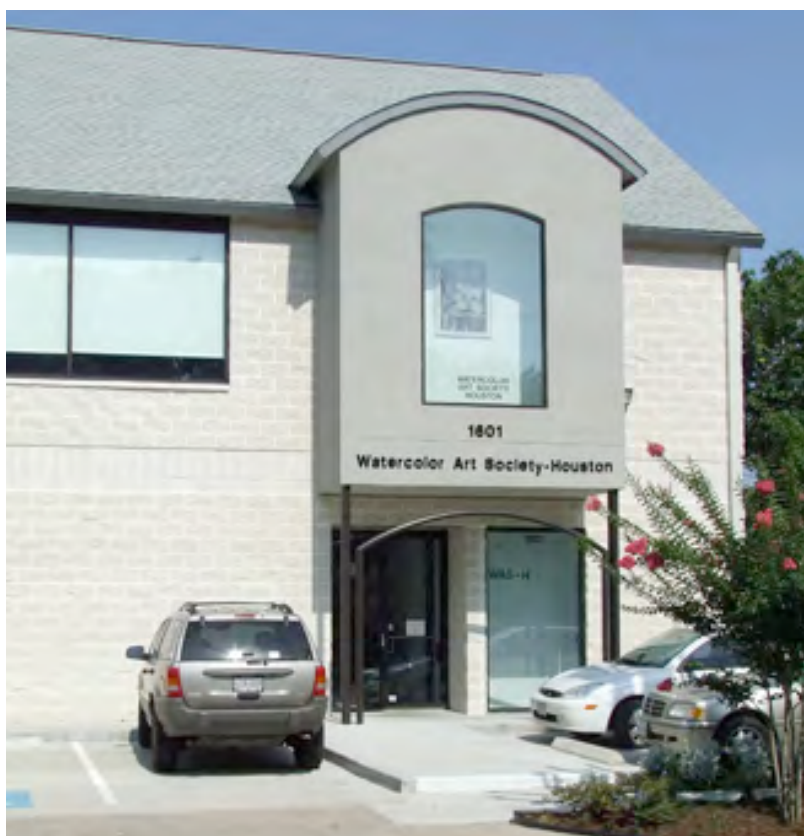
Watercolor Art Society - Houston (WAS-H)