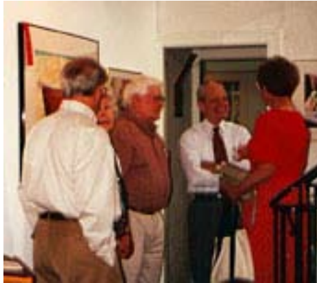
The last stand! An informal conference in the entry to the original 1601 W. Alabama.

The year 2001 found WAS-H still having to find spaces in which to hold our