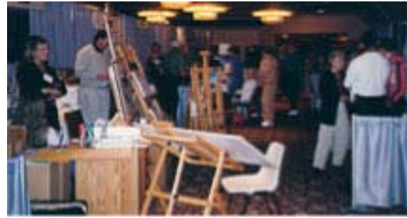
Vendors at Watermedia 2000 awaiting the surge of artists coming between workshops..

artists who demonstrated the many ways to use their products.