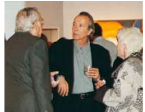
Herb Alpert in conversation at his reception at Buchanan Gallery, Galveston, TX.