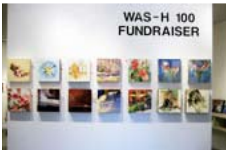
The silent auction wall of the Claybord 100 Rund Raising Sale