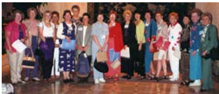
Delegates of the Western Federation of Watercolor Societies in Houston for Watermedia 2000 in the lobby at the Doubletree Hotel Downtown getting ready for the day's activities.

Southern Watercolor (SW) 23rd Annual Competition Exhibition. • From Texas, the Texas Watercolor Society (TWS) 51st Annual