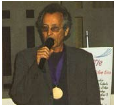
Herb Alpert, wearing his WAS-H Medallion at Watermedia 2003, speaking at gala banquet.

• Herb Alpert was the recipient of WAS-H's Medallion recognizing artis-