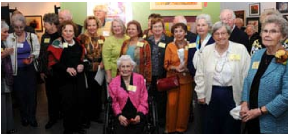
The Founder and Charter members at the reception in their honor.