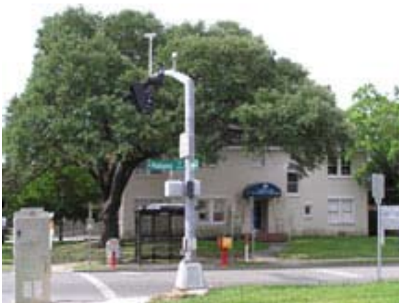
One last look except for the doctored and pruned ancient tree.

Our outreach programs were in full swing, helping us to “grab the golden ring.” Member donations totals in November 2002 were $27,210 with $4,400 pledged. That was about 19%