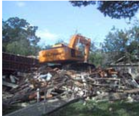
Demolition of the old house to make way for our new building.

of membership participation in the Charitable Foundation.