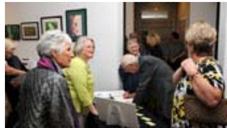
Signing in at the front desk.