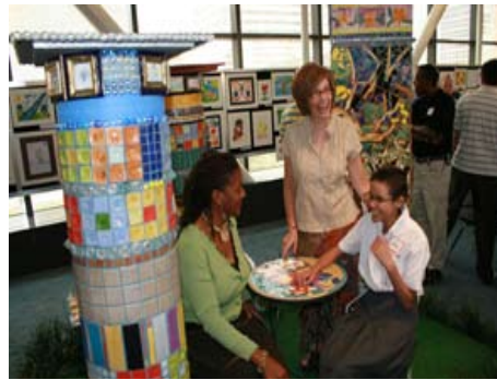
Three magnificent columns and two tables were constructed by the children in the Arts In Medicine program at Texas Children's Hospital.

WAS-H 100 Fundraiser. To its credit, the sales from this exhibit grossed $23,000 and netted $20,000. The funds were committed to help round out our Capital Campaign. 125 clayboards were donated by Amper-sand Art Supply. 100 WAS-H