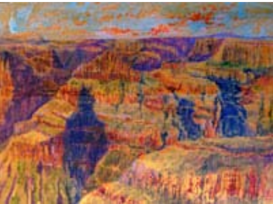
2nd place: Marsha Harris, Flight of Water “This is a very traditional watercolor scene done with wonderful experimental techniques. The metallic underpainting is the ground for many layers of fabulous color.”