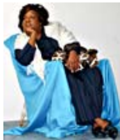
Recent model for Wednesday model lab group.

The Wednesday Model Lab group will continue to meet every Wednesday, 12:30-3:30 (unless there is a workshop scheduled) at WAS-H. Please email me crensink.art@att.net , and I will let