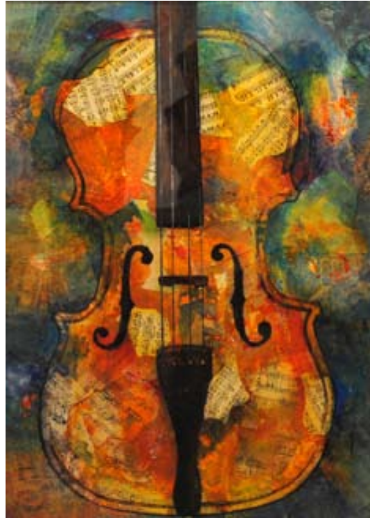
2nd place: Chromatic Variations , by Susan Giannantonio . The painting has collage relating to the subject matter with the use of music sheets. The shape of the violin and the texture of the violin was excellent. The artist also lets the eye fill in those things that aren't apparent.