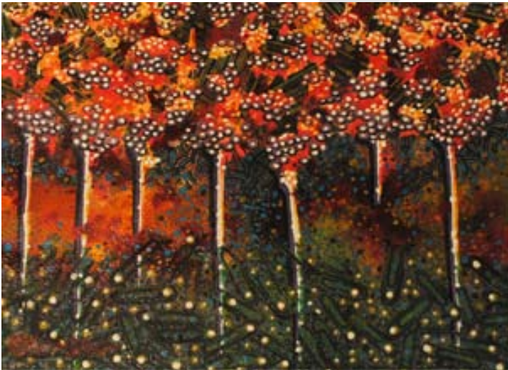
3rd place: Posies , by Sarah Kitagawa . This painting has lovely repetition. The repetition of the flowers and the use of and repetition of the paper clips for the ground created movement in the painting. The colors are very interesting and very vibrant.