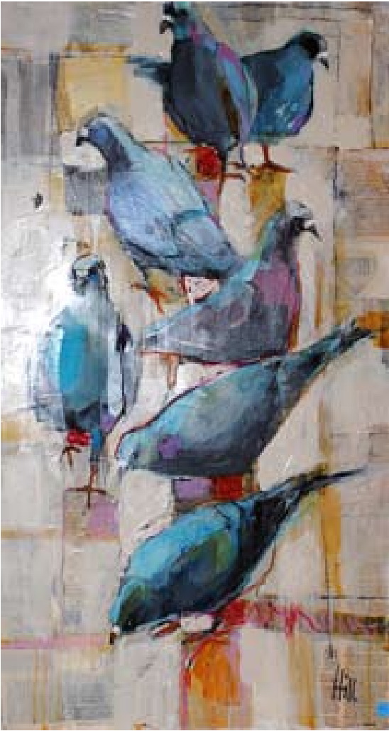
1st place: Pigeon Walk , by Liz Hill . The composition was the main reason for choosing this painting. There is lots of texture in the background. The painting technics are good and there is good use of lights and darks.