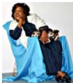
Recent model for Wednesday model lab group.

The Wednesday Model Lab group will continue to meet every Wednesday, 12:30-3:30 (unless there is a workshop scheduled) at WAS-H. Please email me crensink.art@att.net , and I will let