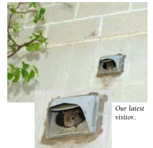
Our latest visitor..