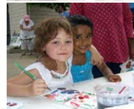
New friends were made at the kids' painting table.