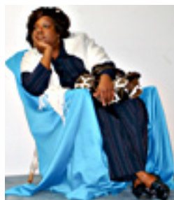
Recent model for Wednesday model lab group.

you know the model each week before the session. So y'all come with your drawing and painting gear and do your own thing for three quiet hours of model time. It is a wonderful opportunity. Carol Rensink, 713-524-5146.