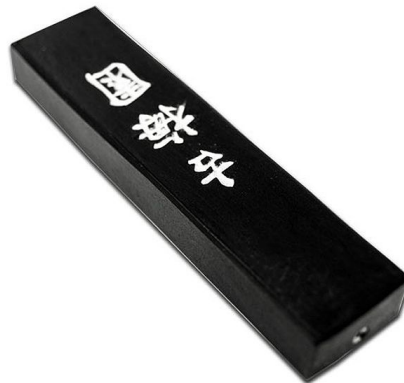
(Left) Yasutomo Suzuri ink stone